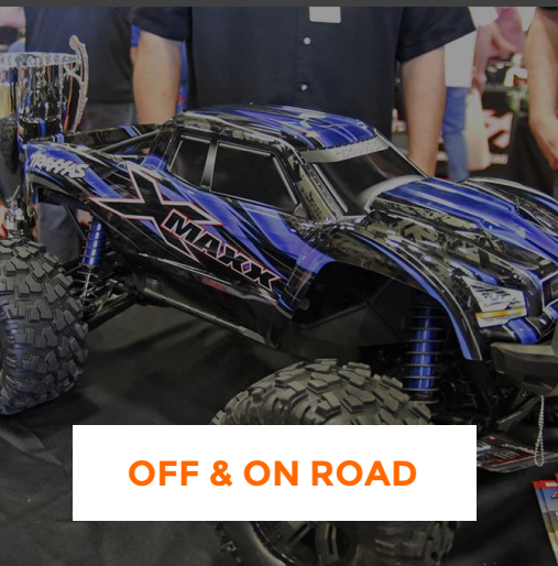
OFF & ON ROAD